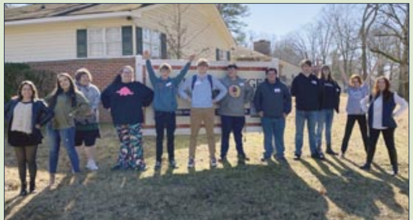
Guests and students demonstrate their favorite "power pose."