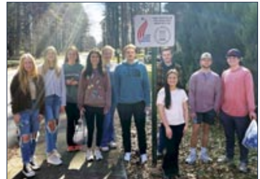
Scholars pick up litter on Gamble Ave during lunch

Other service projects completed by our scholars include collecting and wrapping toys for Capstone Rural Health Center , ringing the bell for the Salvation Army's Kettle Campaign , decorating a tree for Hope for Women's Festival of Lights , helping with the Walker County Arts Alliance's Art in the Park , working downtown during Jasper's Foothills Festival , serving food at Jasper Main Street's Dinner on Main , and more.